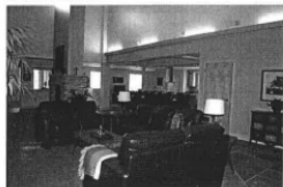
The Teaching Family Homes provide state of the art living space for our youth.