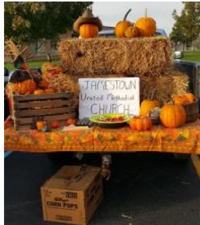
Trunk or Treat 2016 At Jimtown Intermediate