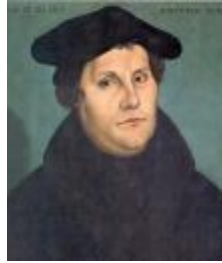
Martin Luther Painted by Lucas Cranach

Reformation Day is one of the days that does not get a lot of attention as a holiday in the United States. On the 31 st of October 1517, German monk, Martin Luther wrote to Albrecht, Archbishop of Mainz and Magdeburg, protesting against the sale of indulgences. He enclosed in his letter a copy of a document that later became known as The 95 Theses which he posted on the door of the All Saints Church. The 95 Theses were quickly translated from Latin into German and printed by the aid of the printing press invented about 75 years earlier.